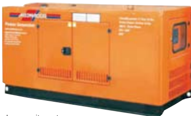
Large units up to 6 Megawatt available