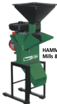
HAMMER Mills & Shredders