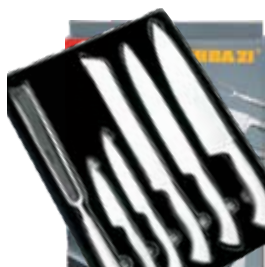
6 Piece cutlery set Code: SH1028 17 000 points