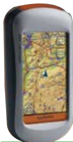
Oregon 300 (without any cards) 93 000 points