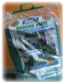
Alnet Ground Sheet Model 431004 15 000 points