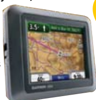
Nuvi 500 87 000 points

Phone the AgriBonus Service Centre for more information