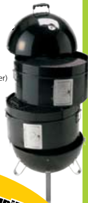
Pro-Q Frontier 23 kg cooking capacity 102 cm x 43 cm (diameter) 60 000 points