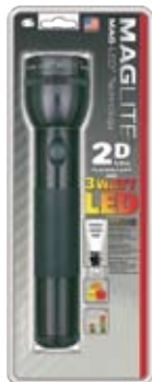
2D Cell LED Code: ML0593 16 500 points